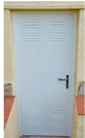
3 YEARS AFTER APPLICATION