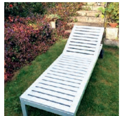
3 YEARS AFTER APPLICATION